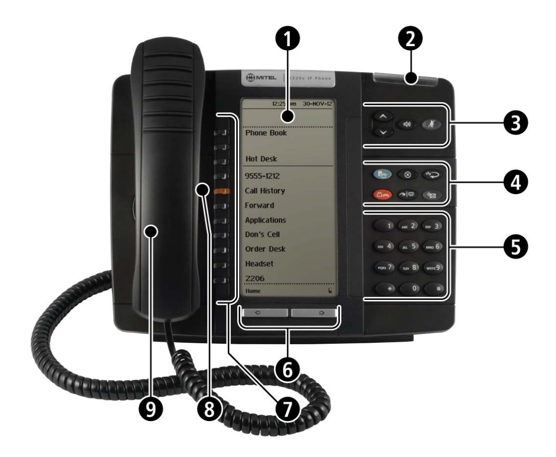
The 5320e IP Phone

The 5320e IP Phone supports Mitel Call Control (MiNet) protocol. It also supports Hot Desking and Clustered Hot Desking as well as Resiliency. The 5320e phone is ideal for executives and managers, and can be used as an ACD Agent or Supervisor Phone, as well as a Teleworker Phone.