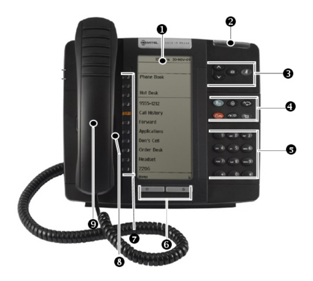
The 5320 IP Phone

The 5320 IP Phone supports Mitel Call Control (MiNet) protocol and session initiated protocols (SIP). It also supports Hot Desking and Clustered Hot Desking as well as Resiliency. The 5320 phone is ideal for executives and managers, and can be used as an ACD Agent or Supervisor Phone, as well as a Teleworker Phone.